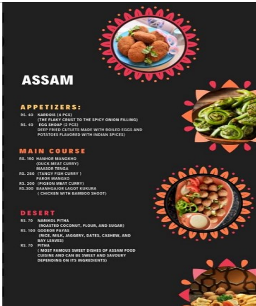
Picture of Menu Designed by a student