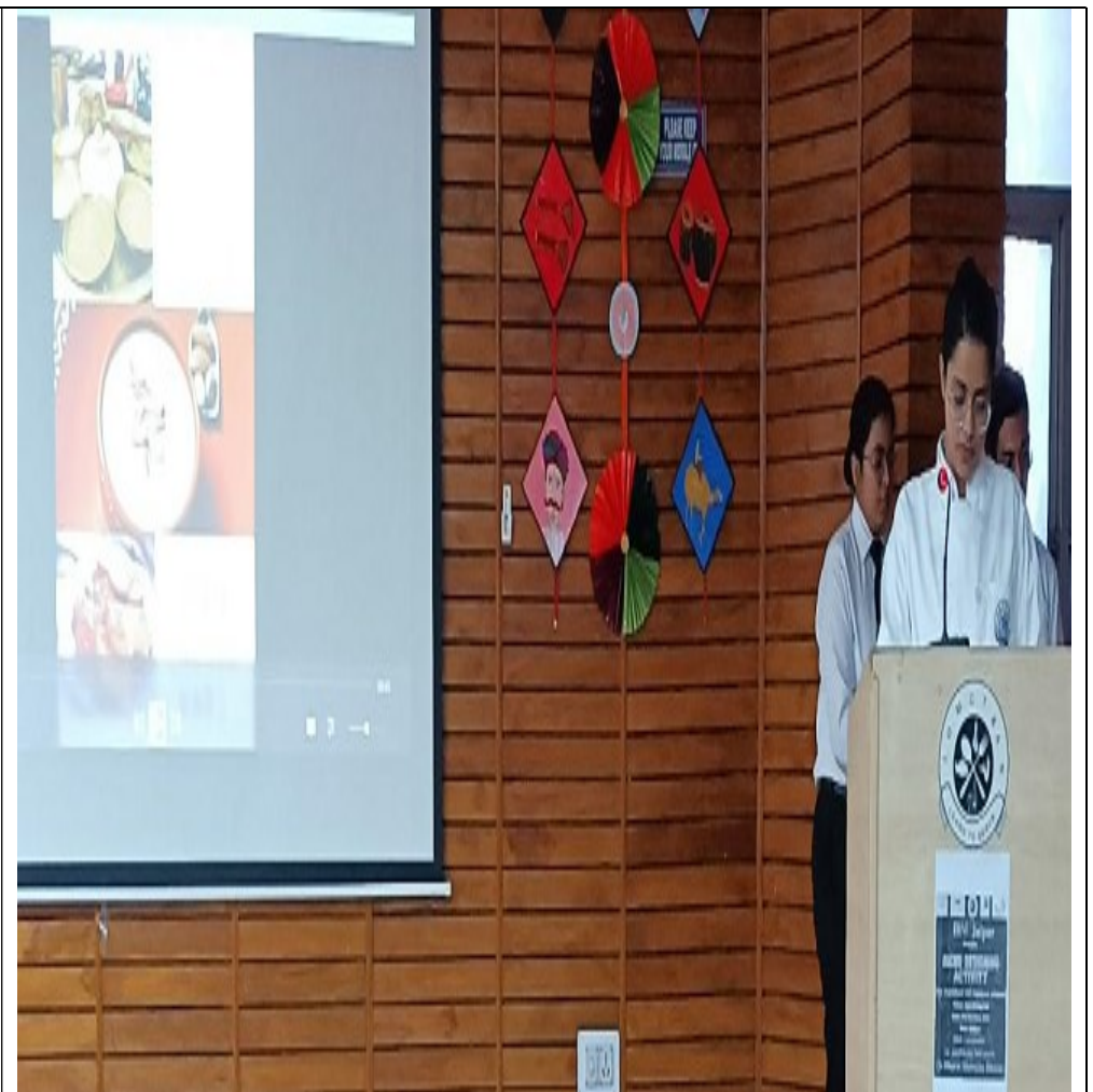
Picture of a student presenting her Menu