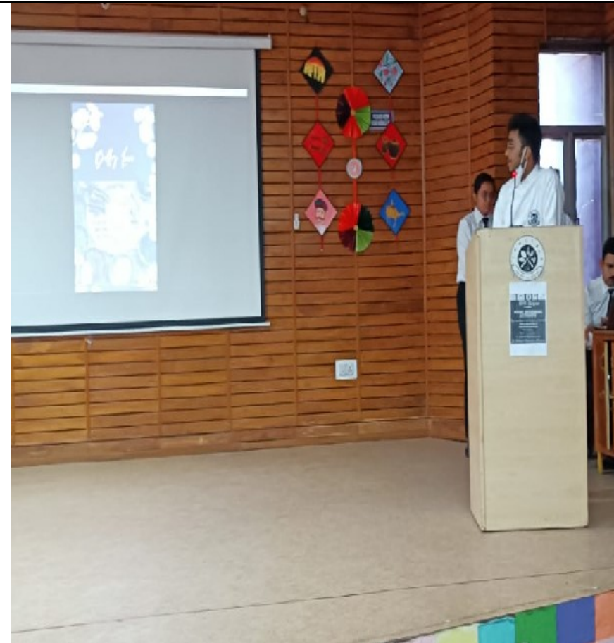
Picture of a student presenting his Menu