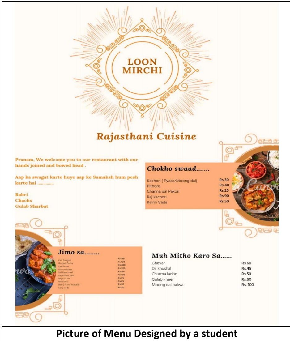
Picture of Menu Designed by a student